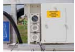
240vDC power to basket