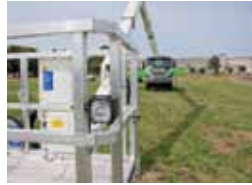
Basket mounted flood lighting