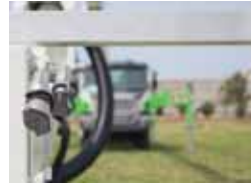
Hydraulic tool outlet (200 bar)