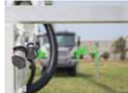
Hydraulic tool outlet (200 bar)