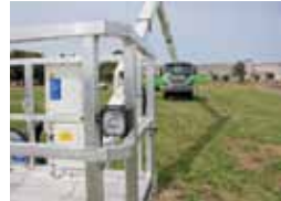
Basket mounted flood lighting