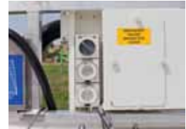
240vDC power to basket