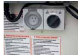
240vDC power to basket