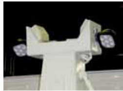
Spotlights to illuminate turret and vehicle deck