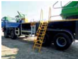
Mine specification fit out #