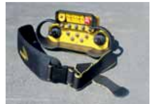
Independent radio remote control for flexibility in line of sight #