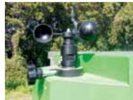
In-built anemometer assesses windspeed