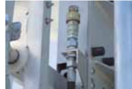
Hydraulic tool outlet [200 bar]