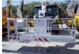
Extendable basket increases work area