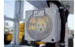
240V power to basket