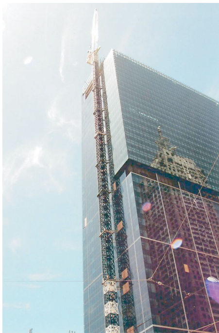
To climb down this Tower Crane, which was as close to the glass as 15 cm. in some sections the building contractor, Multiplex, called in the experts Boom Logistics. The upside for Multiplex, a saving of more than $150,000.

A growth from $0.80 to $4.60 (as at early May 06) shows a rise of $3.80 (475%) in 30 months. That equates to an average annual growth of 190%. A very healthy return from a solid company.