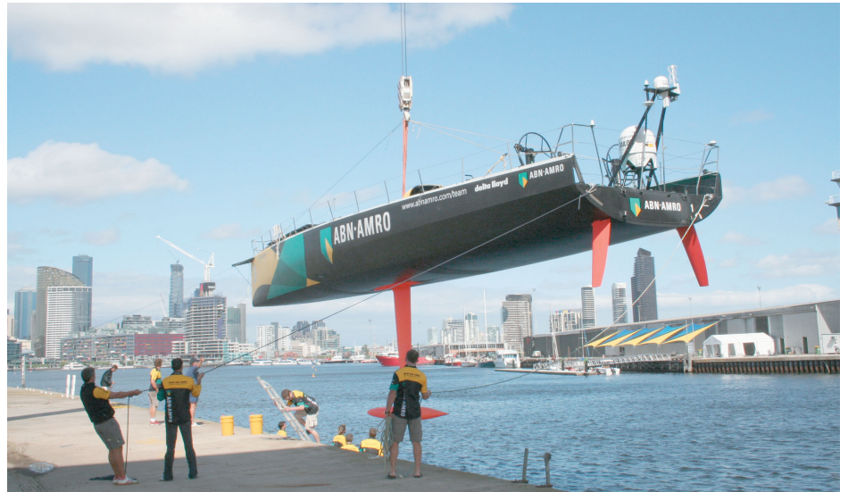
One of the two superb 21 m racing craft sponsored by ABN Amro that reflect great advances in technology and achieve incredible speeds in open seas, around 23.4 nautical miles per hour.

We asked another great sportsman who endures similar deprivation - one of the world's top mountaineers. He too could not really offer a detailed explanation but did quote another famous sailor - Captain James Cook who said: "I want to sail as far as man can sail ... and then beyond."