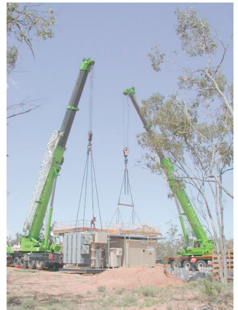
Two of Boom's cranes at work at a distant mine site in W.A. - 180 tonne and 200 tonne Grove cranes. With Boom's and Sherrin Hire's network of depots across Australia, distant sites are not a problem.