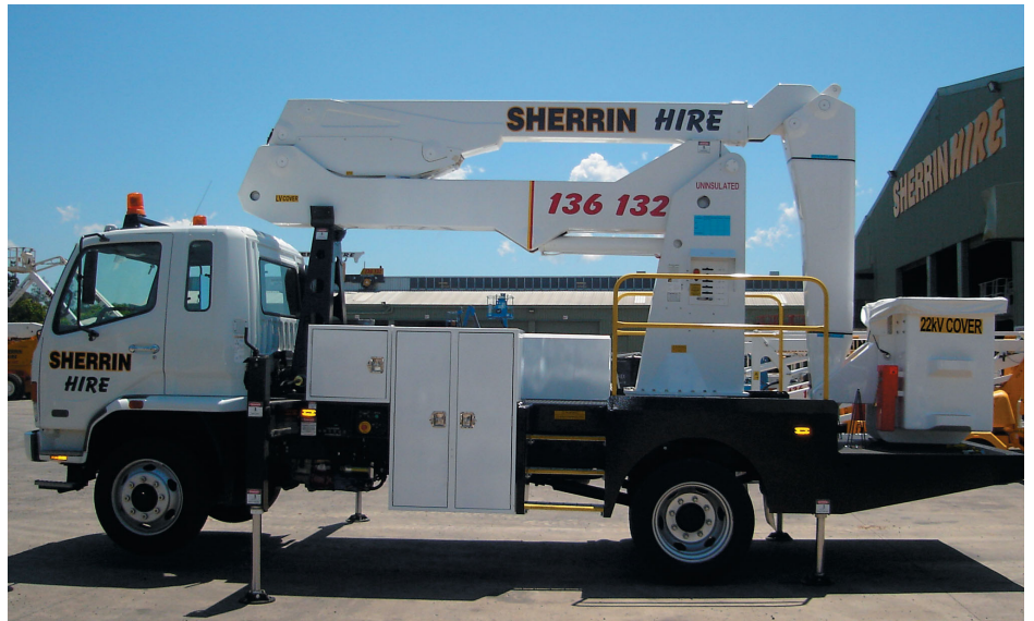
The new Travel Tower, which has achieved new standards in design. It features more fibreglass components ... has a reach height of 18 m.

As a heavily insulated unit, they more than comply with the latest Australian Safety Standards. Improvements include excellent insulation for the bucket (a further advance over other units in the fleet) as well as enhanced insulation around the whole unit.