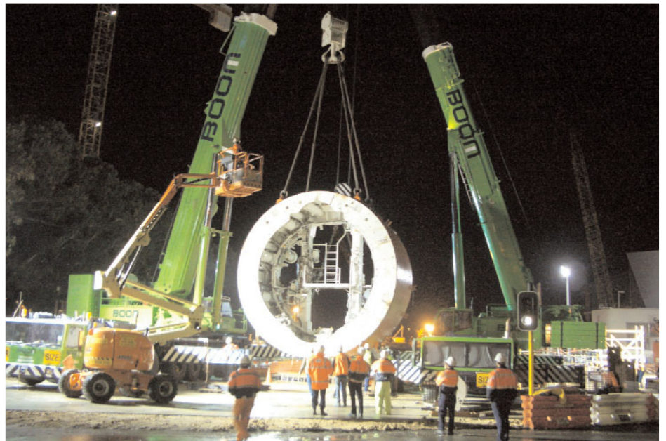
The two Boom cranes at the Perth site ...the task was to top and tail the huge 136 tonne Tunnel Boring Machine.

The issue of developing people - especially bringing on younger people is very important to us. Training facilities continue to be developed for a wide range of staff. We are eager to develop operator skills in the future, we are also committed to apprentice schemes.